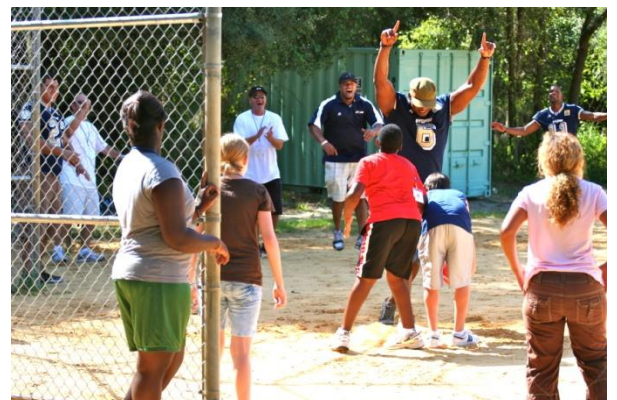
Hillsborough Kids and DCF Staff playing kickball with campers and Tampa Storm players.